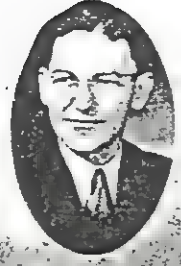
George E. Ulrich Banking